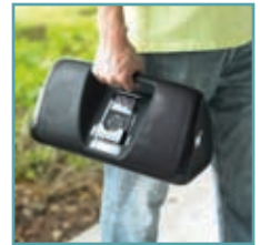
Portable audio system with integrated handle